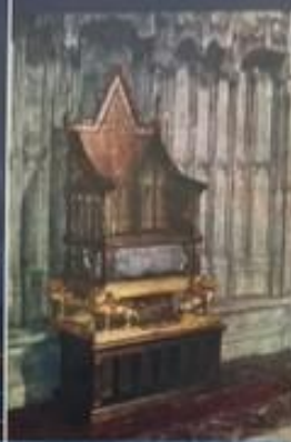
The Throne (Coronation Chair)

The Throne was made in 1296 and has been used since 1534. The seat has a hole in it to accommodate the Stone. The Stone of Scone was used to crown the kings of Scotland and was sequestered there. In 1986, the stone was returned to the Scottish people, although it is retained by agreement by Westminster Abbey for coronations.