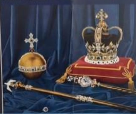
Crown Jewels and Imperial State Crown

The Imperial State Crown is the crown that the monarch wears at King's Coronation. The orb is used to represent the crown's power and governance, and the sceptre symbolises that the monarch's power is derived from God.